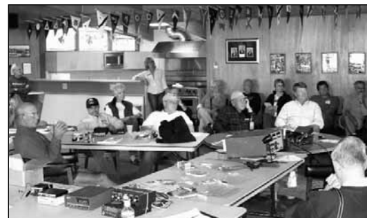
Getting Ready for Open Boat Program

Our Committee meetings are open to all members and guests – we meet on the second Wednesday of the month, 1800 hours at the Portage Bay Mainstation. The meeting schedule for the next few months is: November 14th, December 12th, January 9th. If you have a 2m radio you are welcome to join our “practice” net – the Puget Sound Boaters Net. We meet at 0747 every morning on the 146.88 MHz repeater.